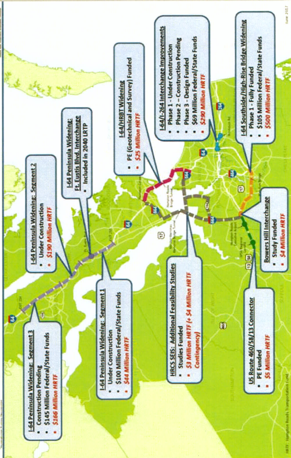
Figure 1 – Activities of HRTAC/HRTF Funded Projects

TPO Projects Planned and Prioritized by HRTPO, Powered by HRTAC HRTAC