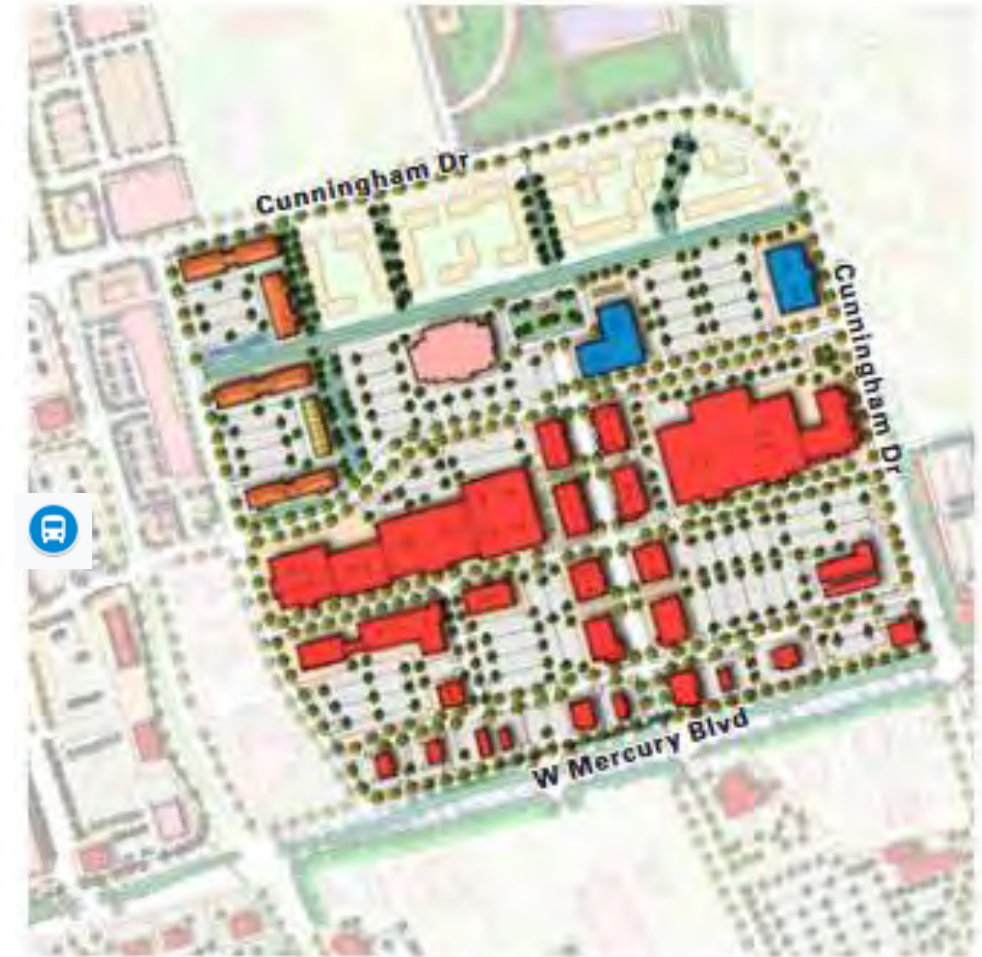
PREFERRED ALTERNATE FULL BUILD-OUT