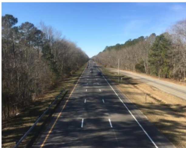
Existing facility looking westbound from weigh station