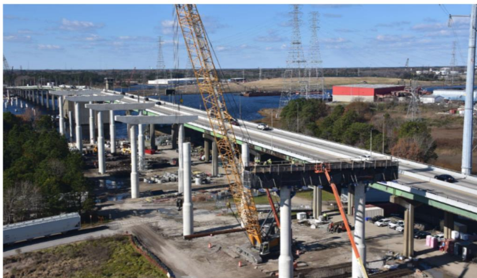
HRB Looking West