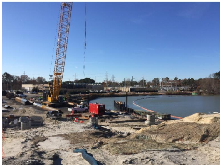
Setting Sheet Piles Bridge B-621