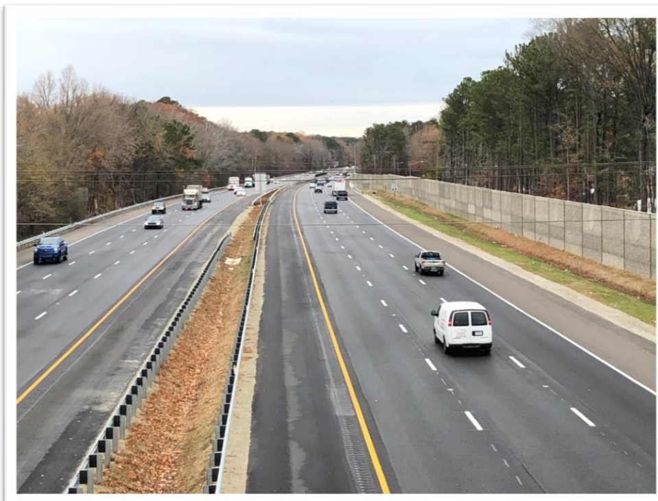
Project Site (Looking West from Denbigh Blvd.)