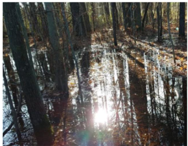
Wetland south of eastbound lanes near Sondej Avenue