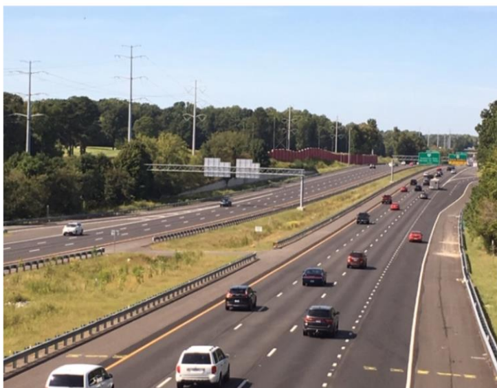
Project Site (Looking East from the Exit 243 overpass)