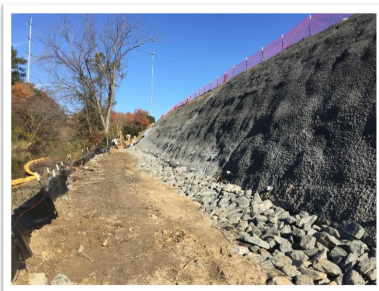
Soil Nail Wall Nearing Completion, I-64 EB