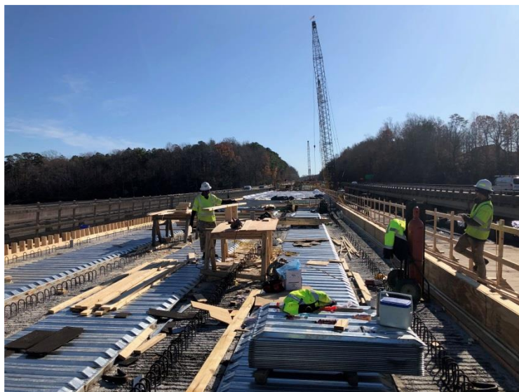
Bridge deck operations at the Westbound Queens Creek Bridge