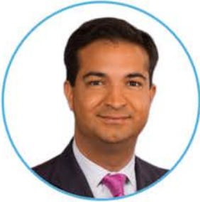
Carlos Curbelo Former Congressman, Florida