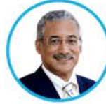
Rep. Bobby Scott, (D-VA)