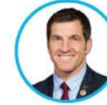
Former Rep. Scott Taylor, (R-VA)